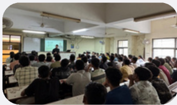
Expert Talk on Career Path For an Engineer

The CE and CSE-DS Departments, in collaboration with VAA, organized an engaging expert talk on “Career Paths for an Engineer” for 3rd-year CE and CSE-DS students. The session was held on 11th July 2025 at the VGEC campus and aimed to guide students about the diverse opportunities and directions available in the field of engineering.