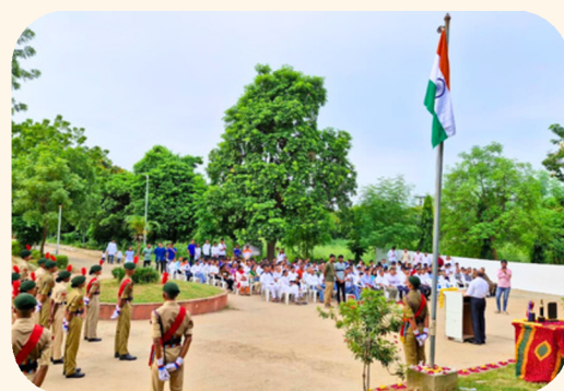
79 th Independence Day Celebration

The highlight was the Drama Club's riveting play Shourya, based on Operation Sindoor. The celebrations culminated in an energetic Tiranga Rally across the campus, symbolizing unity, freedom, and the indomitable spirit of our nation.