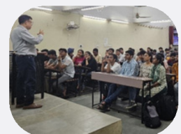
Students indulging in expert talk "Piping Engineering and Process Plant Engineering"