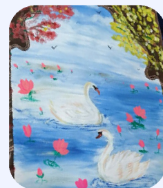
A painting presented at "MeghDhanush 8.0"

AdvaNature Club successfully organized MeghDhanush 8.0 - A Drawing Competition on 3rd Sep '25. With themes of Boundless Adventure, Nature, Conservation and Sketching Heritage, students beautifully expressed their ideas through colors and art.