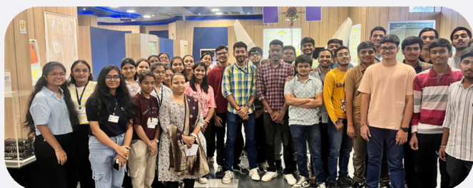
Visit to VSSE

The EC Department also arranged an industrial visit to the Vikram Sarabhai Space Exhibition (VSSE) on 5th and 6th August 2025 for Semester 3 students. The visit provided students with insights into India's advancements in space research and applications, inspiring them to explore opportunities in the field of space technology.