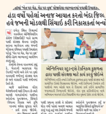
Expert Talk: "Sustainable Water Management"