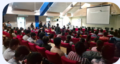
Orientation Programme - TCF