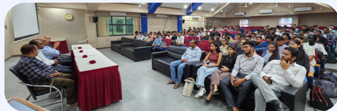
“BIM-Driven Construction Design” Expert Lecture

The Applied Mechanics Department organized an expert lecture on “BIM - Driven Construction Design : A Modern Approach” on 23rd Jul '25 at Visvesvaraya Auditorium for Sem 3 and 5 students. The talk introduced Autodesk Revit, STAAD Pro, and AR/VR in construction.