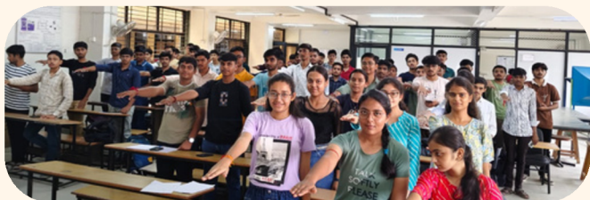
Students at the Pledge Ceremony

The E-Cell celebrated World Entrepreneurs' Day on August 21, 2025, with a pledge ceremony in the Department Classroom. Over 300 students participated, taking a collective pledge to nurture innovation, creativity, and entrepreneurial spirit.