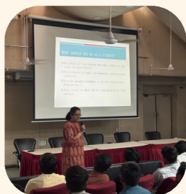
Expert Lecture on Empowering Students for NBA

The Civil Engineering Department held an expert lecture on “Empowering Students for NBA Awareness & Contribution” on 23rd Jul '25 at Visvesvaraya Auditorium. Students learned about accreditation processes, documentation, and participation during NBA visits.