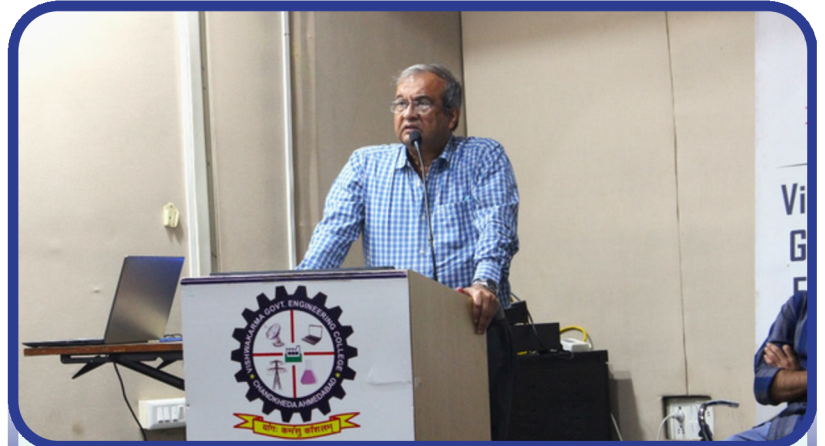
STTP on Electric Vehicles & Hydrogen Fuel Cells