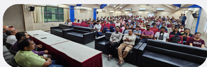
"SCC Mix Proportioning" Expert Lecture

The Applied Mechanics Department conducted an expert session on "Advancement in SCC Mix Proportioning" on 23 July 2025, where students explored innovations, challenges, and the importance of special concrete mix design students on placements and career growth.