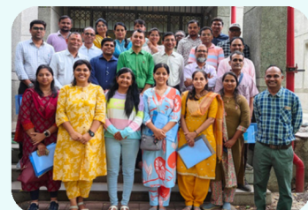
Glimpses of STTP

The Department of Electrical Engineering, VGEC Chandkheda, with sponsorship from GUJCOST and approval from CTE Gujarat, organized a one-week STTP on “Electrifying the Future: A Comprehensive Exploration of Electric Vehicles and Hydrogen Fuel Cells” from July 28 - August 1, 2025.