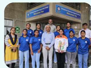
Kabaddi Team Girls with the Principal