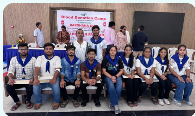
NSS Volunteers at Raj Bhavan Blood Donation Camp