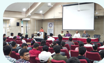
Expert Lecture on "SCC Mix with Ultratech Cement"

An expert lecture on "Advancement in SCC Mix Proportioning" was organized on 4th Aug '25 by the Applied Mechanics Department in collaboration with Ultratech Cement.