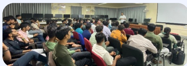
Students attending the lecture on “Drilling Safety”