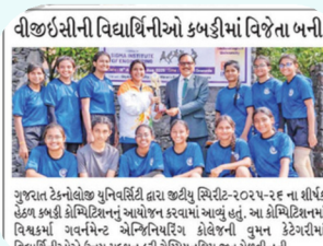
Kabaddi Team Girls-proud moments