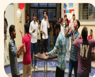
Quickie Quest Event

Instrumentation & Control Engineering Department organised a Quickie Quest event under the IEI student Chapter VGEC, Chandkheda on 26th August 2025. This