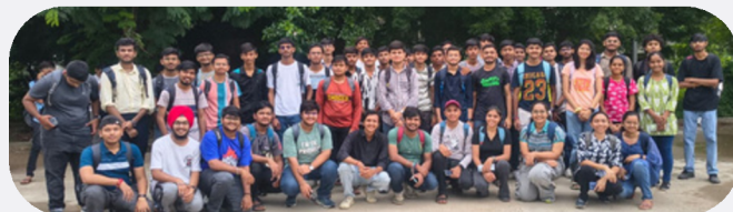
Students at "Campus Walk"

The Campus Photo Walk was a refreshing journey through the lens - where participants explored the beauty; found unique perspectives, framed stories in every corner of the campus. It was conducted by VGEC Photography Club on 4 th Sep '25.