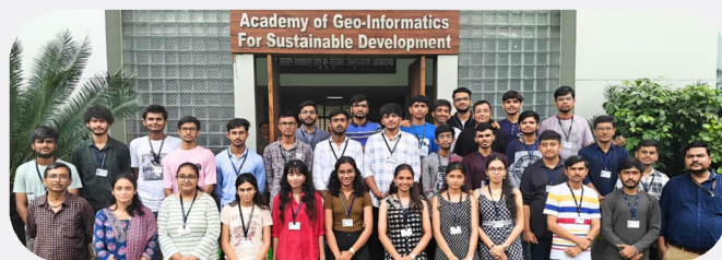
Visit to BISAG

The EC Department organized an industrial visit to BISAG, Gandhinagar on 25 th and 26 th July 2025 for Semester 5 students. The visit aimed to provide students with valuable knowledge about emerging technologies in the field of communication, particularly focusing on satellite communication systems.