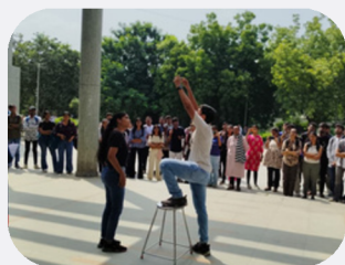
Audience at drama performance "Out of Syllabus"

The Drama Club proudly wrapped up its drama "Out of Syllabus" with an overwhelming response from the audience on 3rd Sep '25.