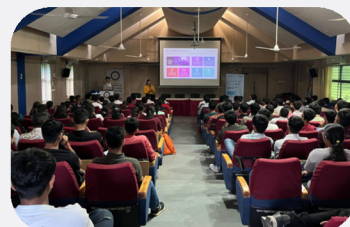
Students at IBM-Skillsbuild Programme

GKS led - IBM offline workshop for all branches as part of AI skilling and Innovation camp to be organized in Nov '25 as per MOU between GKS and IBM.