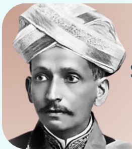
Sir M Visvesvaraya The Father Of Indian Engineering

M. Visvesvaraya is a significant Indian engineer and statesman whose birth anniversary on September 15 is celebrated as National Engineers' Day in India. The day honors his extensive contributions to India's infrastructure, particularly in water resource management, and serves to recognize the crucial role of all engineers in the country's development and innovation.