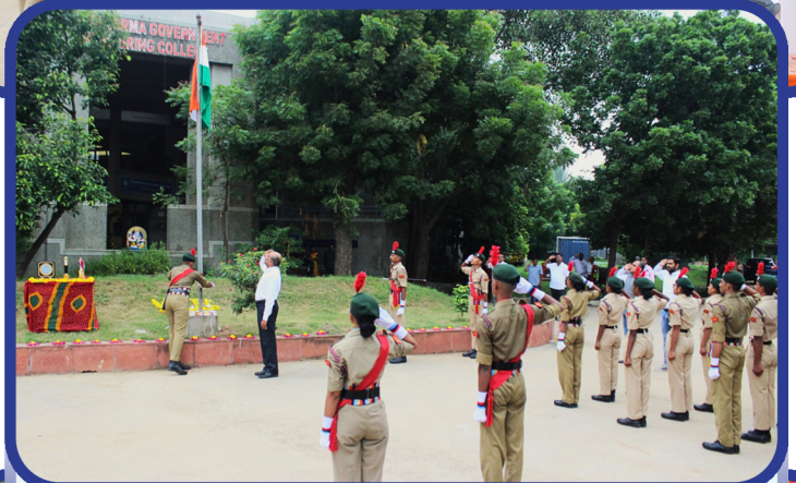
Celebrating 79 th Independence Day in VGEC Campus