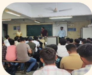
Students attending session "From Classrooms to Careers"