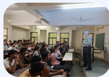
Workshop on Effective Listening