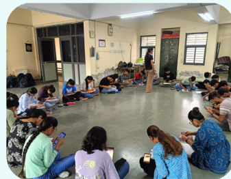
NSS Recruitment Programme 2025

The NSS Unit successfully organized its Recruitment Programme from 1st to 9th September 2025, receiving overwhelming participation from students across departments guided by the motto “Not Me, But You”.