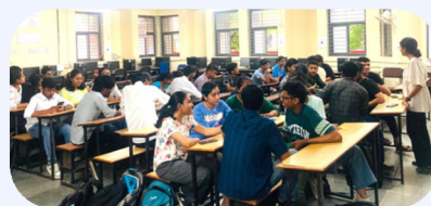
Students engaging at a Mission English Session