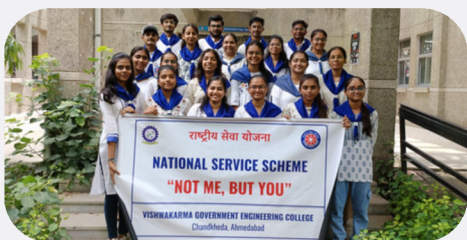
NSS Orientation Programme 2025