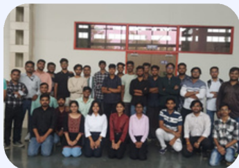
Visit to IPR, Bhat

An industrial visit to the Institute for Plasma Research (IPR), Bhat was organized by the EC Department on 4th August 2025 for Semester 7 students.