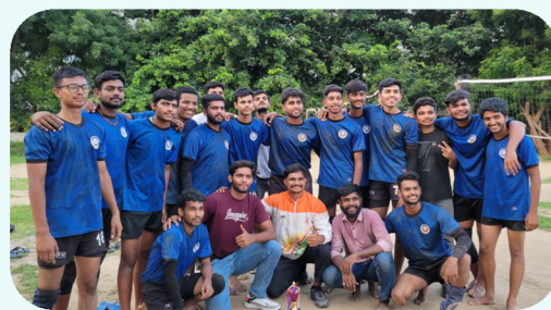
Kabaddi Team Boys with their winning trophy