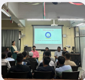
Students at "Alumni Interaction for Freshers"